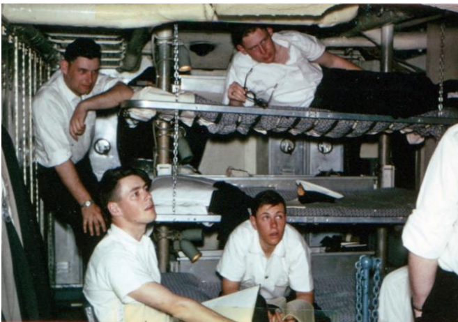
8 Mess – Prestonian Class Frigate 1961 Punka louvres – no Air Conditioning

Our program will focus on commemorating the Centennial of the Naval Reserves, and the accomplishments of its current and past members including those who took part in its the various officer training programs from the UNTD to the ROUDP, NROC and RESO and beyond.