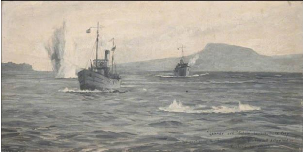
HMS Lanner and HMS Salvia under Bomb Attack in Suda Bay; They went about their hazardous duty fearless and determined (1941).