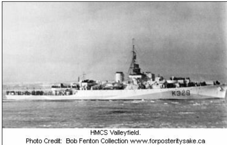
HMCS Valleyfield.

drafted to HMCS Stadacona where he was placed in the manning pool until 14 February 1944 when, on very short notice – referred to as a piethead jump - he was drafted to HMCS Valleyfield and immediately sailed for Boston in a convoy of 25 merchant ships and four escorts including Valleyfield .