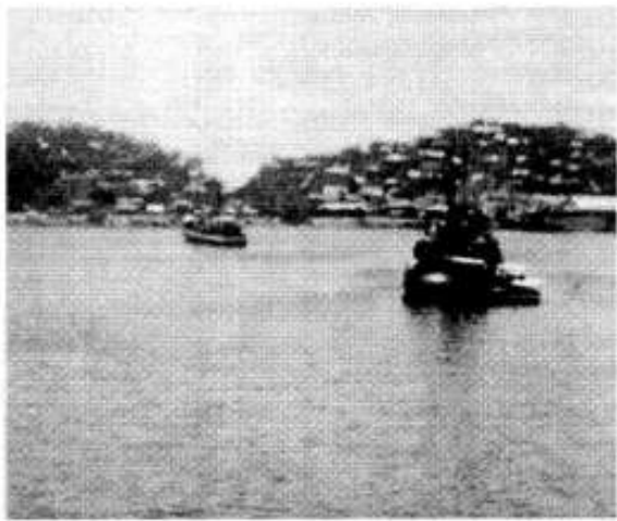
The sea going tug, HMCS Clifton in Manzanillo Harbour, as see from the deck of HMCS Laymore.

The next port of call was Long Beach, California. Finally after a month of adventures on the high seas and exciting foreign port visits, we arrived in Vancouver. While we were stationed in Esquimalt for another three weeks we were required for an Admiral's funeral party and had to practice the slow march.