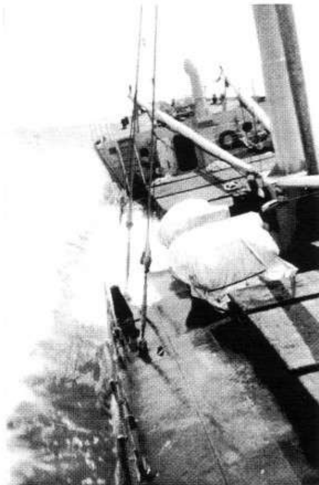
HMCS Laymore rolling through the Caribbean on her way to the Panama Canal.

Going through the choppy Caribbean, the flat-bottomed Laymore tossed and turned. While on the wheel, we had to wear sneakers to stop from slipping in the fifteen-degree rolls.