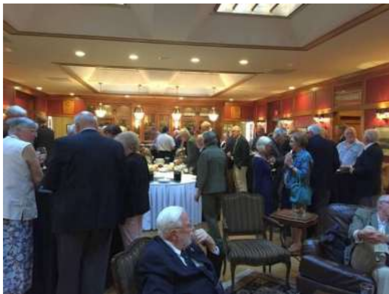
UNTD Weepers - Ranchman's Club Calgary - June 25th