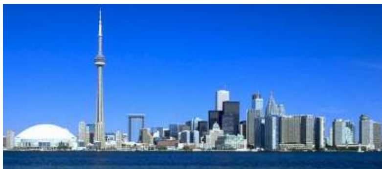
Toronto Skyline from Centre Island

From their patio is afforded one of the best views of the Toronto Skyline. The May cruise was a trial run with a ship's company of 4 while the August cruise had a complement of 12.