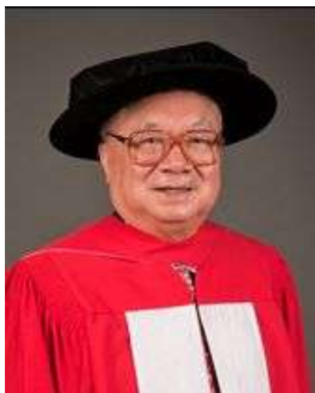
Sir Gordon Wu - LLD - U Manitoba - May 2012

His list of accomplishments and accolades, honorary degrees and awards, is lengthy and of international scope. His philanthropy has extended into the $100 of Millions including support to the university that gave him his start. He supported the construction of the University of Manitoba's Faculty of Engineering's new home – the Engineering Information and Technology Complex. In May 2012 Gordon was given an Honorary Doctor of Laws from University of Manitoba in recognition of this and other acts of largesse.