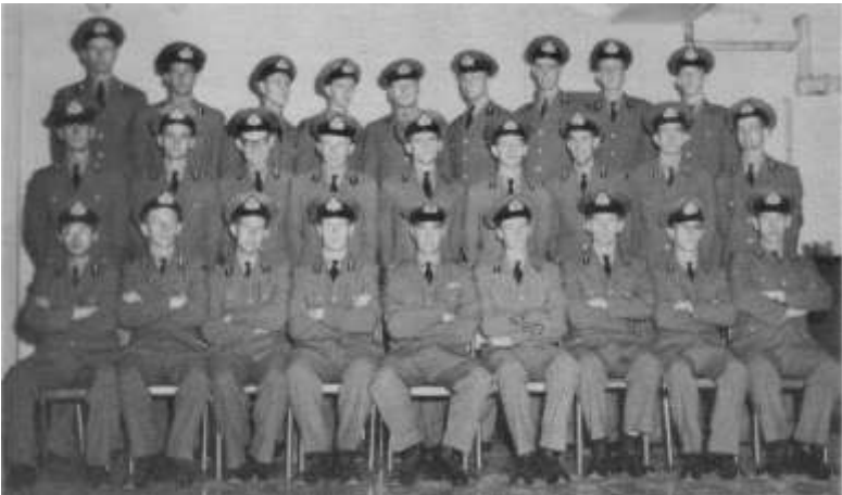
Antigonish Division 1954 - Gordon Wu 1st row, 1st left

The following academic year Gordon was at Princeton and he remained there until getting his Civil Engineering degree in 1958.