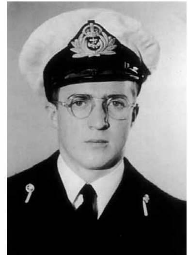
Llewellyn, April 12, 1950